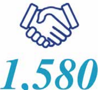
Nearly 1,600 students benefited from a DMACC Foundation scholarship.