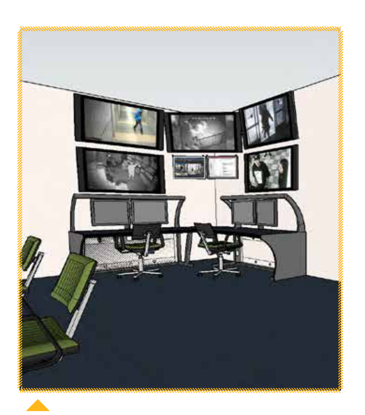
A monitor room is included on the lower level, offering an opportunity for training on state-of-the art electronic equipment and to provide a "real-world" experience for students and professionals participating in continuing education or advanced training.