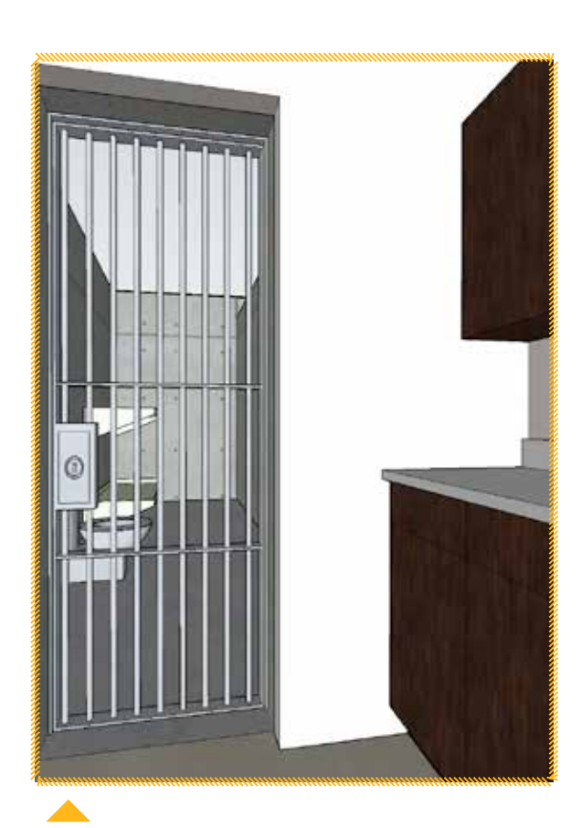
A mock cell is included on the lower level to bring an authentic atmosphere to a variety of training activities.