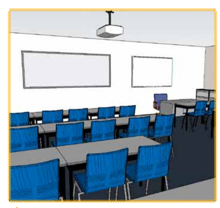
The centerpiece of the lower level is a large classroom space that includes the latest in technology.