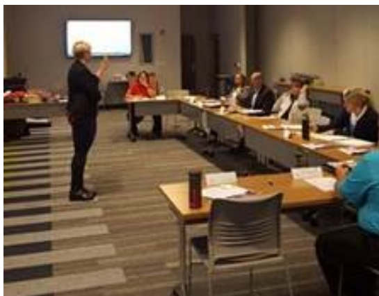
Picture: Assessment group working on creating a user-friendly assessment website that includes assessment activity calendars, templates and information.

With this template, Continuing Education has created other online courses for Funeral Director Relicensure and are looking at creating a License Renewal for the Auto Dealers course.