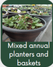
Mixed annual planters and baskets