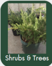
Shrubs & Trees