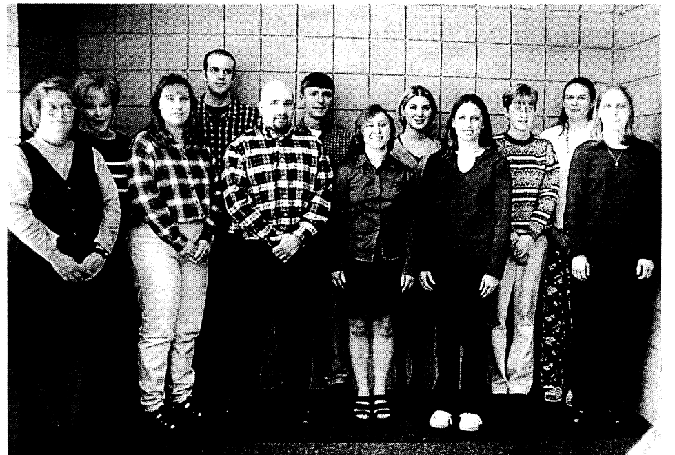
Bear Facts photo