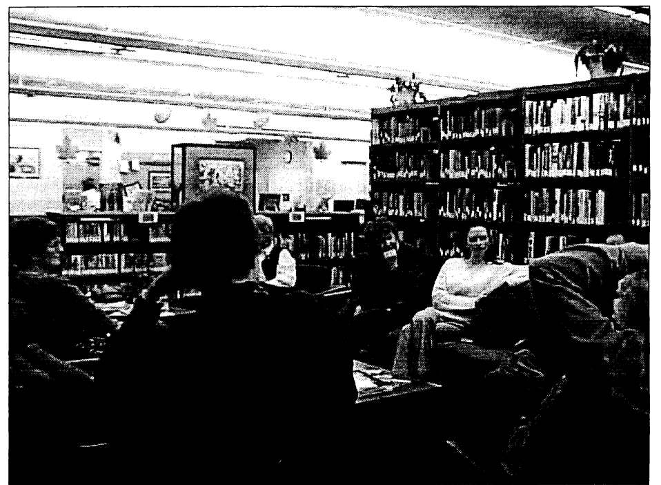
Bear Facts photo

So, there is good news and bad news to this "no jobs" dilemma. The bad news is that the only option left for non work-study (except for international students) is to apply at a business off campus somewhere. The good news is, some if not most of the off-campus jobs pay the same or more than work-study and your hours or earnings can't be limited. As for you international students, you are out of luck until DMACC gets a bigger budget or you transfer to a 4-year school.