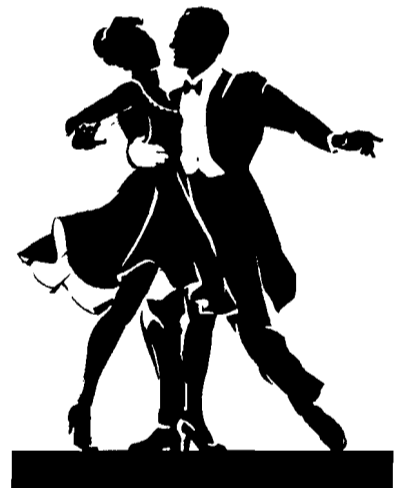
First Meeting of the DMACC Ballroom Dance Club

The purpose of the club is to promote Social and Competitive Ballroom Dance in Iowa. The meetings provide a chance to learn ballroom dances and to get involved in some activities. Plans for the coming semester will be made at this first meeting also. The dances being taught this semester are the, foxtrot, waltz, cha-cha, and swing.