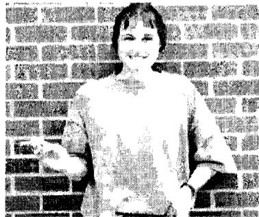
More on page 3

Boone Campus-- Bear Facts staff is sponsoring a clean up for Earth Day, April 22, 1996. All students, faculty and staff willing to spend an hour picking up litter on the east access road, are asked to meet in the Courter Center at 9:05 a.m. Rotaract, a Boone Campus service club, will provide refreshments after the cleanup in the center.