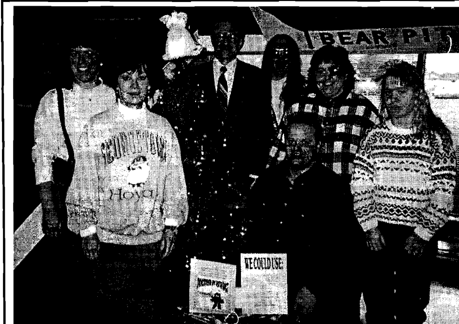
Rotaract Club urges students and staff to donate to their recent holiday clothing, decoration, and toy drive for the Lighthouse Program in Boone.