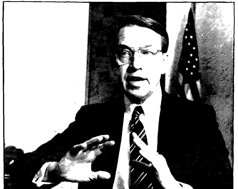
Senator Charles Grassley speaks at Boone campus

The EPA has targeted agriculture for new regulations. In-