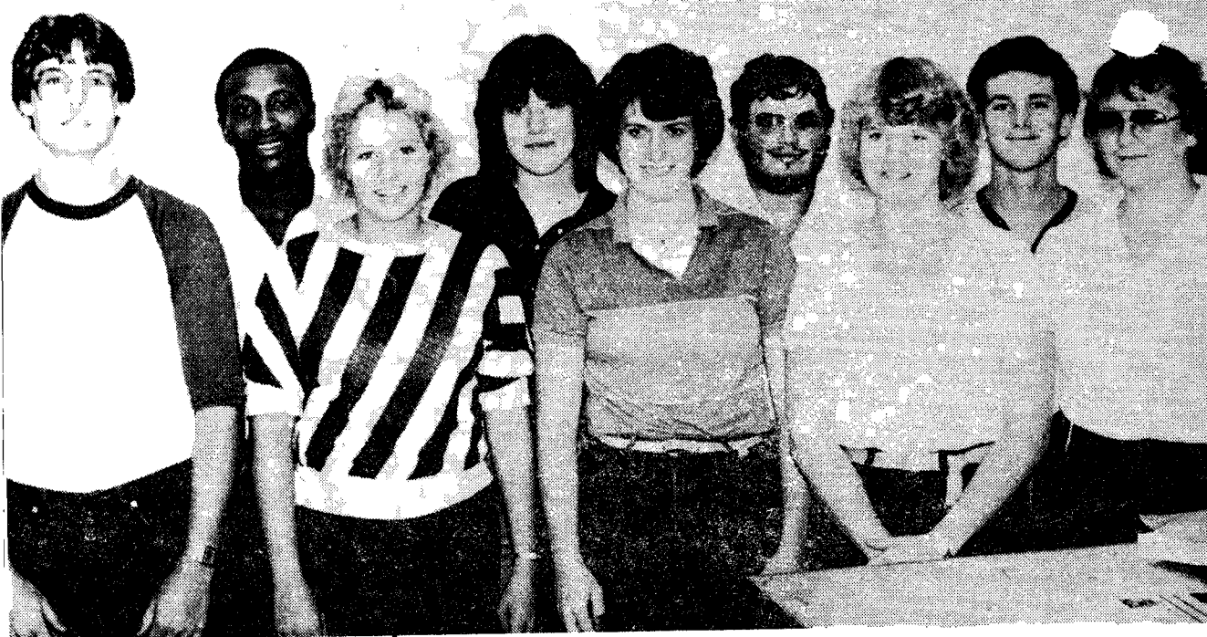
ANXIOUS TO BEGIN a new year of publication of The Bear Facts, the student publication of Boone Campus, DMACC, are the above staff members. From the left are