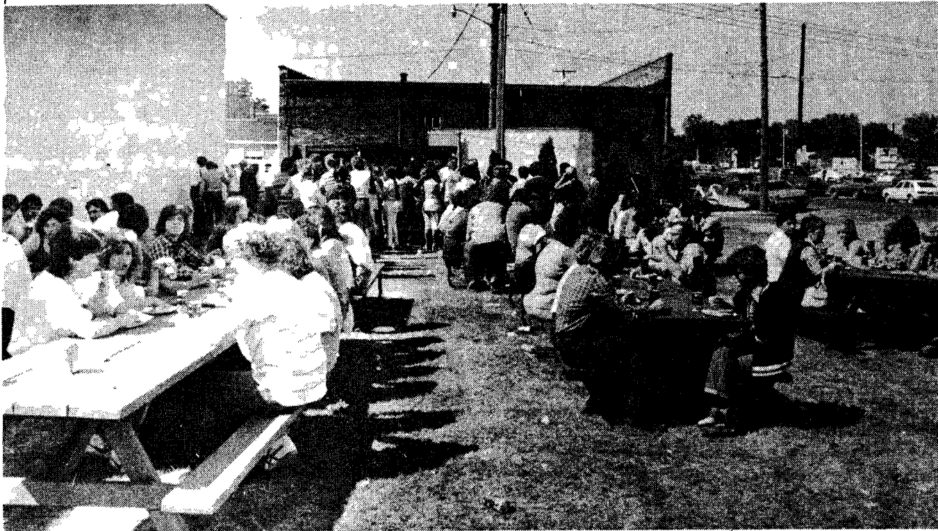
IT WAS FEEDING TIME for the entire Boone Campus student body on the first day of fall classes, and the meal was catered by the Boone Area Chamber of Commerce. Free hotdogs and